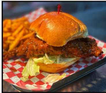
Bones Hot Dip Chicken Sandwich

**CONSUMING RAW OR UNDERCOOKED MEATS, POULTRY, SEAFOOD, RIBEYE, SIRLOIN, AND PRIME RIB SPECIALS, SHELLFISH OR EGGS MAY INCREASE YOUR RISK OF FOOD BORNE ILLNESSES. INGREDIENTS MAY CONTAIN THE FOLLOWING ALLERGENS: PEANUTS, TREE NUTS, MILK, EGG, WHEAT, SOY, FISH OR SHELLFISH. CONSUMER DISCRETION IS ADVISED.**