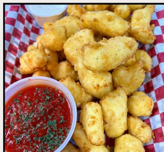
Cheese curds are local from Brown Creek Creamery