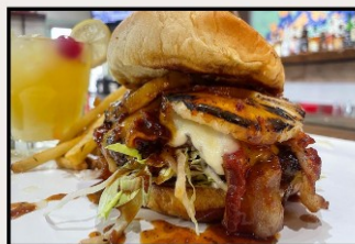
Wife Material Burger